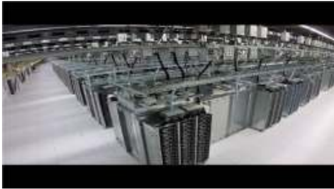
Google Data Center https://youtu.be/XZmGGAbHqa0